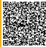
INTERACTIVE MAP OF HIKING TRAILS IN CEDARVILLE & HESSEL

*PEEKABOO IS A BRAND NEW TRAIL IN OUR AREA THAT IS INTENDED FOR MOUNTAIN BIKING, BUT CAN BE HIKED AS WELL!